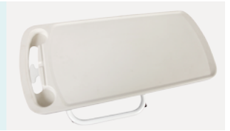
Table top is made of HDPE, easy clean, high quality environmental material, light weight, corrosion resistance, impact resistance, easy to clean and disinfect, durable for use. With groove to put cups and pen.